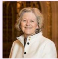
Baroness Hollins Wordless Books Supporting Language